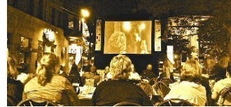
Nashua Dinner and a Movie

Dreyfuss. A delicious dinner of American Tapas will be served by Stella Blu , one of Nashua's best. Movie starts at 7 PM, dinner and beverages are served by Stella Blu off a menu and paid for separately. Event ends around 10:45 PM. (Rain Date Thurs. 4 Aug) Check out the movie website for details, tix, and directions.