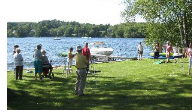
Enjoying games by the beautiful lake