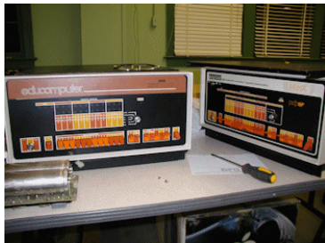
An Education market PDP-8

Here are some photos of the computers you may see running there this year!