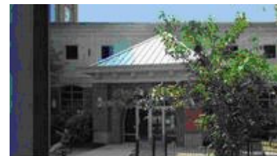
Pond Plaza at the Mill in Maynard